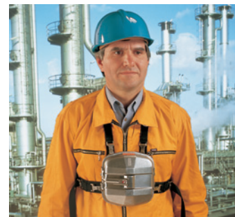
SSR 30/100 B