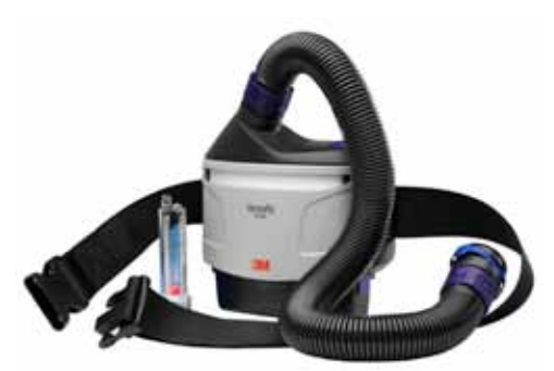
*Nuisance level" refers to concentrations below the occupational exposure limit (OEL)