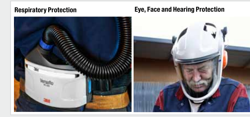
Head Protection, Neck/Shoulder Coverage