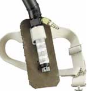
V-100 Cooling Vortex