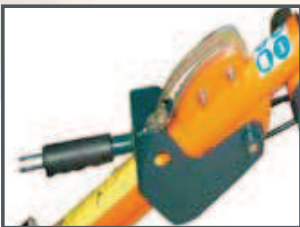
'Pro tilt' system