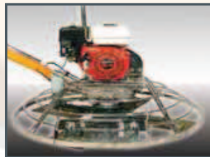
Honda engine as standard