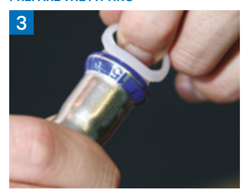
Remove the protection plug and visually check the seal ring.