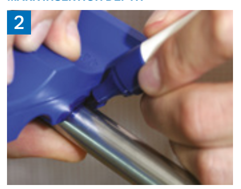
To ensure the pipe is fully inserted before pressing. Gives visual security.