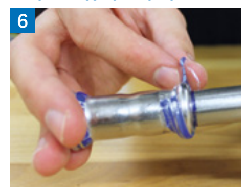
Remove pressing indicator. Check the correct insertion depth has been met.