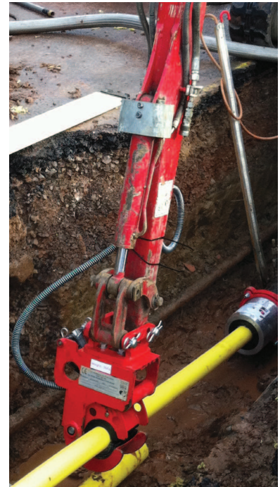
A Mini Pipe Handler is also available for use with a mini excavator. Please contact us for further information.