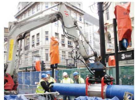
Manoeuvring 500mm diameter pipe in Central London

The PE can then be positioned in the trench and be inserted into the host main. All these operations are powered by the hydraulic power of the excavator and are controlled from the cab using the direction button or the foot pedal. There is no need for the operative to handle the pipe or enter the trench.