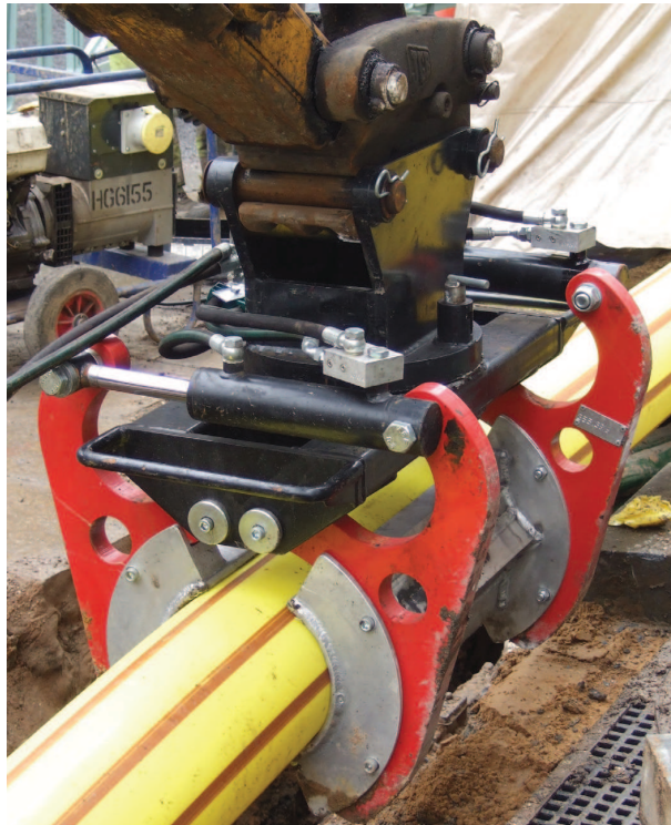
The 355 Pipe Handler, fitted with 250mm aluminium shells inserting Profuse PE pipe

Pushing forces experienced onsite will vary depending on the make and model of excavator