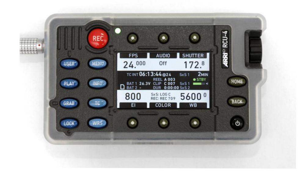
Figure 1: RCU-4