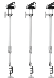
Type 635187 Extension Arms (Set of 3)