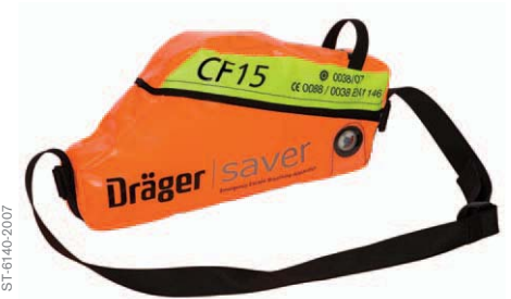
Dräger Saver CF Constant flow emergency escape equipment

The Dräger Saver CF utilizes a simple fail-safe reducer system with excellent flow characteristics giving a consistent air flow rate at all cylinder pressure levels.