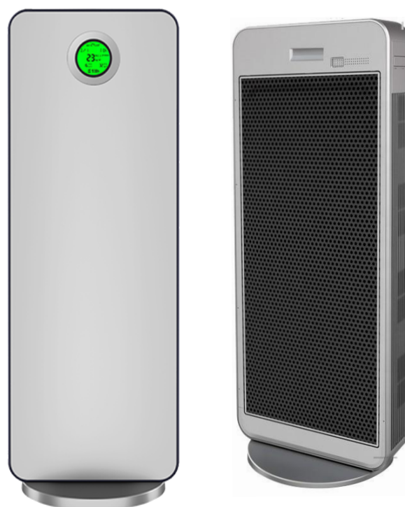
Floor Stand Included

Copyright © 2002 – 2020 Air Conditioning Centre / Martin Industries Air Conditioning Centre is a registered trademark of Martin Industries Ltd. E&OE. Registered in England & Wales Co. No. 05436428