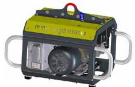
ROPOWER 70.02 – 5029900002