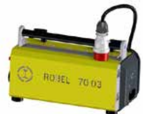
400 Volt power supply – 5039900003