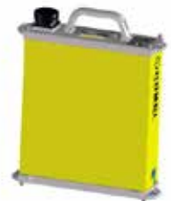
Battery 2300 Wh – 7839900001