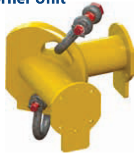
Table 1 – Component List