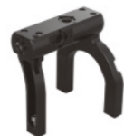
235 Low Mode Handle LMH-1 K2.55006.0