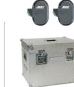
Case for two 120m/400ft Steadicam Mags K2.65050.0