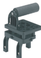
235 Low Mode Support LMS-1 K2.55014.0