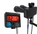
Ultrasonic Distance Measure UDM-1 Set K0.60055.0 Cable UDM-435 K4.65672.0