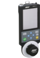
Wireless Remote Control WRC-2 incl. Control Knob Unit - for Sets please see Overview 5.5.0