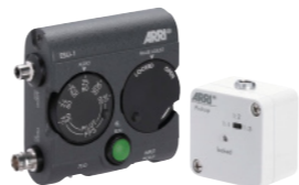
External Sync Unit ESU-1, K2.46006.0 Cables KC-32 & KC-33 and pickup box included