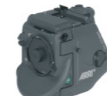
Arriflex 235 Body 4P K1.55000.0 3 perforation conversion kit K4.65170.0