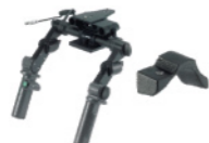
Shoulder Set ARRICAM Studio/Lite incl. Shoulder Pad K2.54023.0