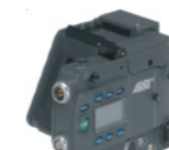
Arriflex 235 Body 3P K1.55000.3 4 perforation conversion kit K4.65226.0