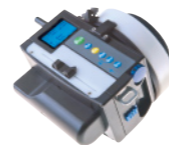
Wireless Control Unit WCU-3 K2.65155.W (White Radio)