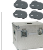
Case for four 120m/400ft 235 Shoulder Mags K2.65005.0