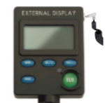
External Display EXD-1, K2.55013.0, (incl. cable KC-100 S 0.8 m / 2.7 ft, K4.65207.0) KC-122 S 20 m / 66 ft, K2.65067.0