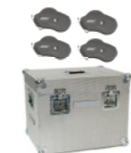
Case for four 60m/200ft 235 Shoulder Mags K2.65047.0