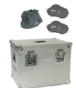
Case for 235 and two 60m/200ft 235 Shoulder Mags K2.65004.0