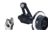
Lightweight Follow Focus Set LFF-1 K0.60021.0